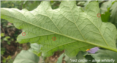
*red circle – alive whitefly