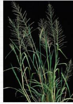
Palay maya ( Leptochloa chinensis )

Ang matinding maglilinis sa inyong madamong sibuyasan. Pwede pang gamitin hanggang bulb formation na walang sunog sa inyong tanim.