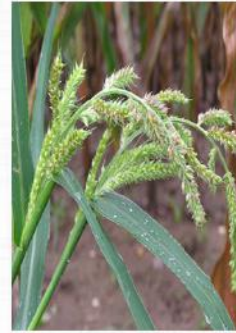
Antena/Telebisyon ( Echinochloa crusgalli )