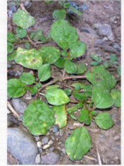
Tabtabukol ( Trianthema portulacastrum )