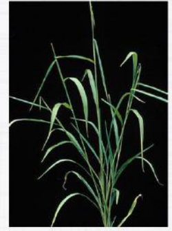
Trigo-trigohan ( Ischaemum rugosum )